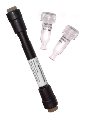
Figure 1. Multiple Affinity Removal column and spin cartridges.